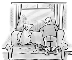
"Until now, I never understood why you got so excited when someone walked past the house."

Wife: Did I get fat during Quarantine? Husband: You were never really skinny! Time of Death: 4/25/20 11:23 pm Cause of Death: Corona virus